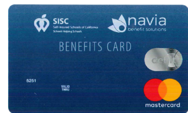
Easy debit card payment